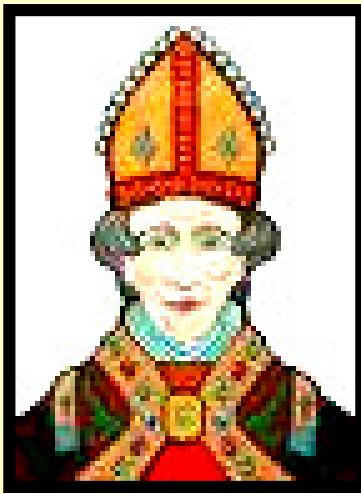
Archbishop Stephen Langton

responsible for CHAPTER DIVISIONS in the Old and New Testaments